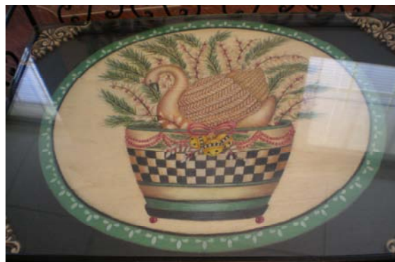
Colored pencil art on a wood tray, submitted by Pat Hull for the annual GCDA Christmas basket raffle to be held on December 9, 2012.